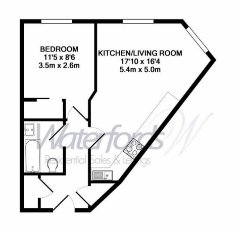
Whilst every attempt has been made to ensure the accuracy of the floor plan contained here, measurements of doors, windows, rooms and any other items are approximate and no responsibility is taken for any error, omission, or mis-statement. This plan is for illustrative purposes only and should be used as such by any prospective purchaser. The services, systems and appliances shown have not been tested and no guarantee as to their ocerability or efficiency can be given.