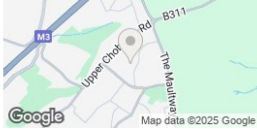
Description ***THREE BEDROOM HOUSE AVAILABLE JULY***

Waterfords are bringing to the market this modern family home located in Heatherside. local amenities are within walking distance. Available January on a unfurnished basis.