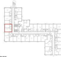
Ground floor 1/500 @ A4

Flat 15 Fleet House Barley Way Fleet Hampshire GU51 2QT