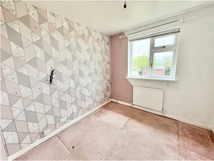
Bedroom Three 8'5" x 9'0" (2.59 x 2.76)