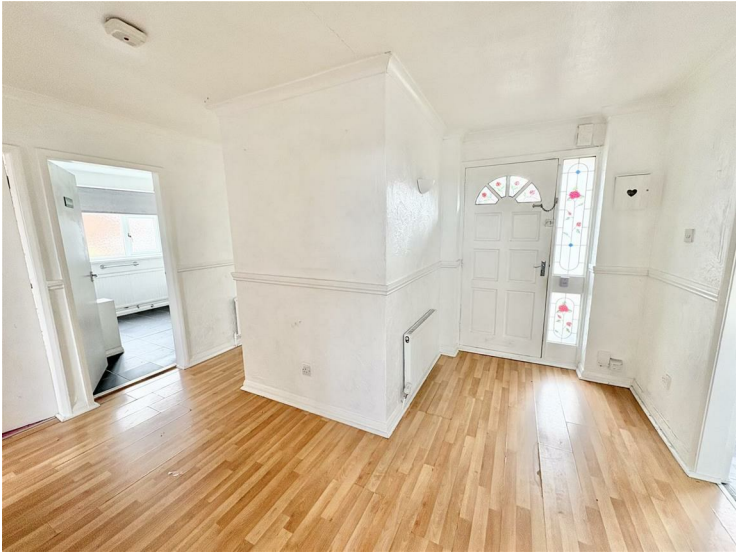
Entrance Hall 13'5" x 10'9" (4.10 x 3.30)