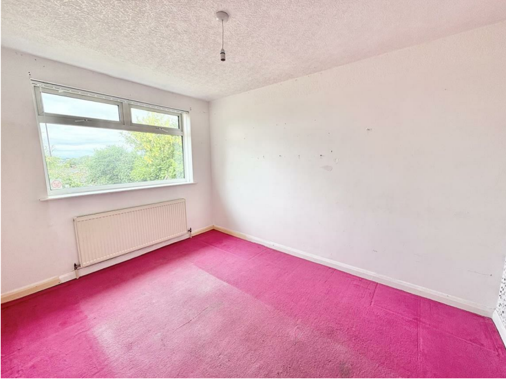
Bedroom Two 12'0" x 8'11" (3.68 x 2.72)