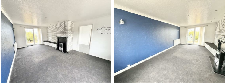
Reception Lounge 13'4" x 21'9" (4.08 x 6.63)