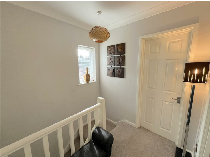
First Floor Landing 7'10" x 6'11" (2.38 x 2.11)