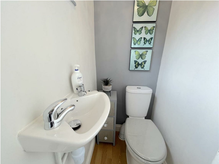
Downstairs WC 2'7" x 5'6" (0.80 x 1.68)