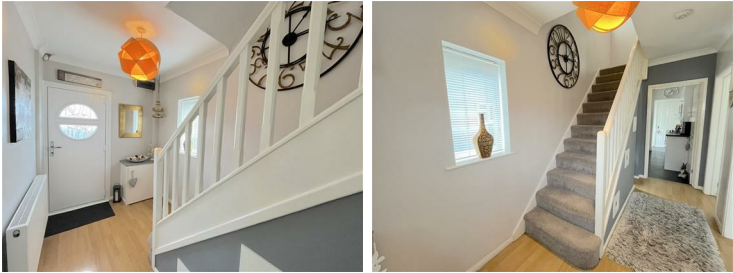
Entrance Hall 6'5" x 14'0" (1.95 x 4.26)