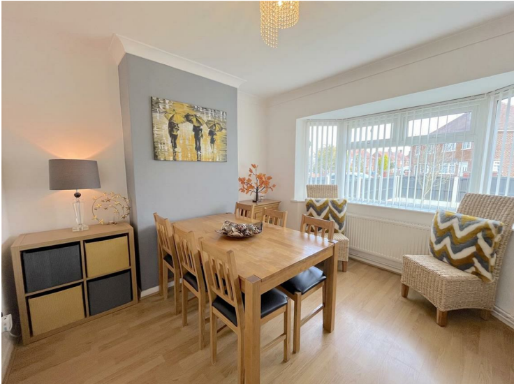
Dining Room 10'4" x 10'9" (3.15 x 3.27)