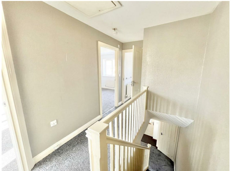
First Floor Landing 12'0" x 7'0" (3.66 x 2.15)