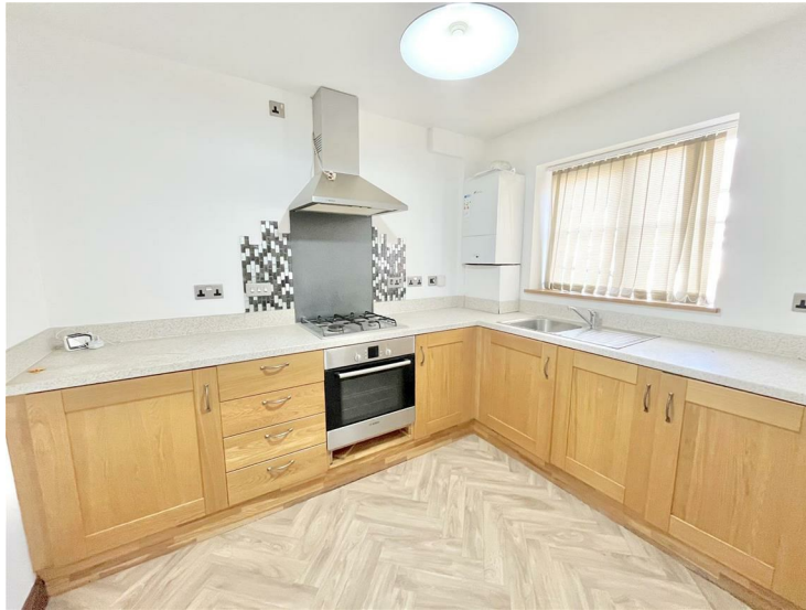
Kitchen Diner 9'6" x 9'10" (2.90 x 3.00)