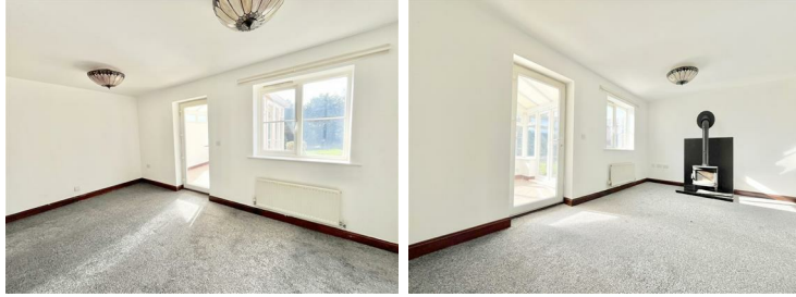
Reception Lounge 17'0" x 10'0" (5.20 x 3.05)