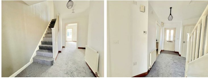
Entrance Hall 13'10" x 7'6" (4.22 x 2.30)