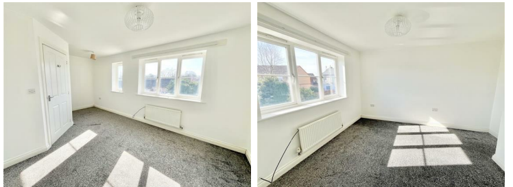
Bedroom One 17'0" x 12'5" (5.20 x 3.81)