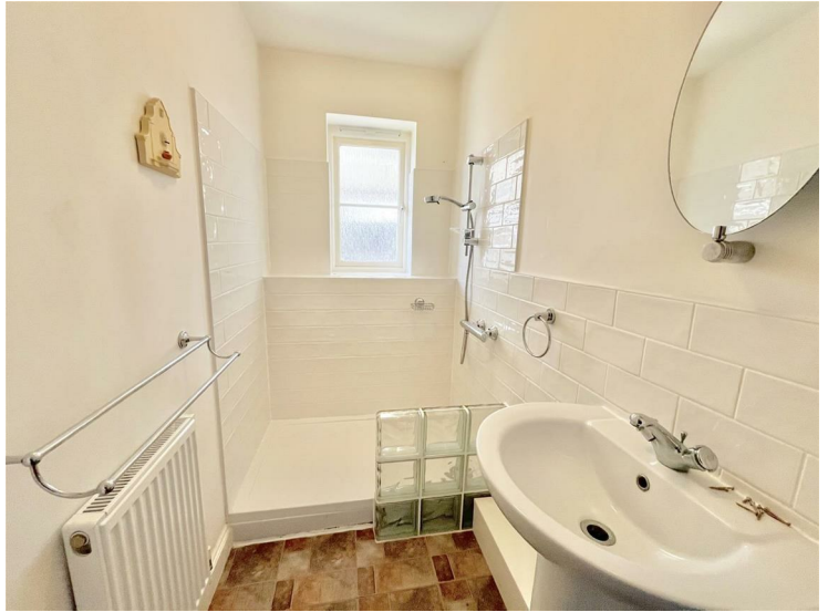
Downstairs Shower Room 7'1" x 4'0" (2.16 x 1.22)