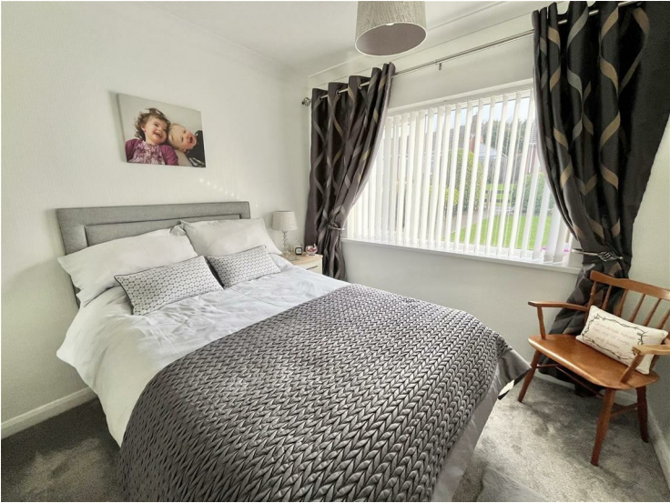
Bedroom Two 10'4" x 9'0" (3.17 x 2.76)