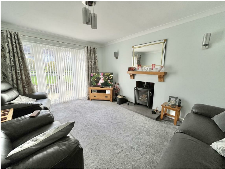
Reception Lounge 15'4" x 11'10" (4.68 x 3.63)