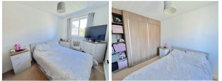
Bedroom One 8'0" x 13'4" (2.44 x 4.07)