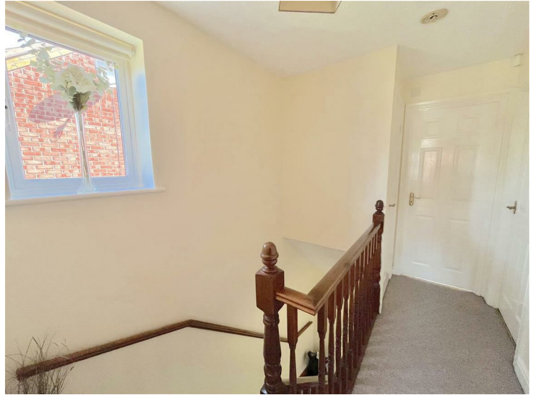
First Floor Landing 10'6" x 6'4" (3.22 x 1.94)