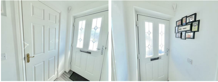
Entrance Hall 6'2" x 3'5" (1.90 x 1.05)