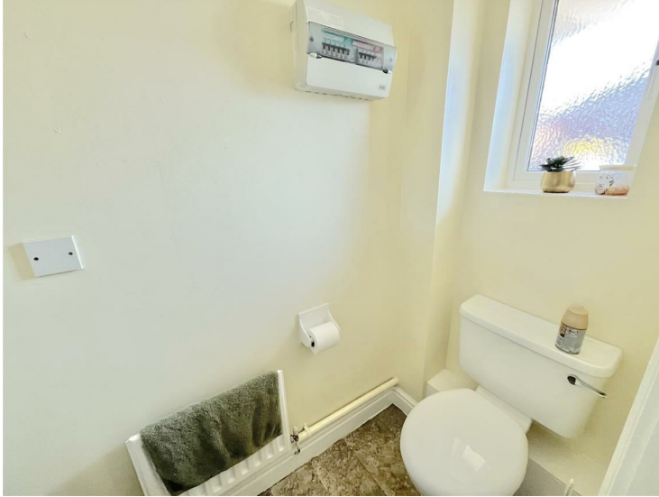
Downstairs W.C. 6'4" x 2'11" (1.95 x 0.91)