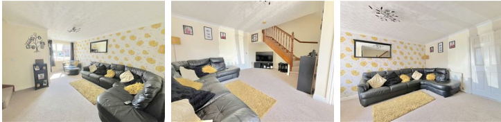
Reception Lounge 17'1" x 15'4" (5.21 x 4.68)