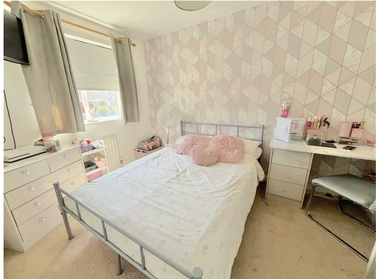
Bedroom Two 11'8" x 8'0" (3.58 x 2.45)