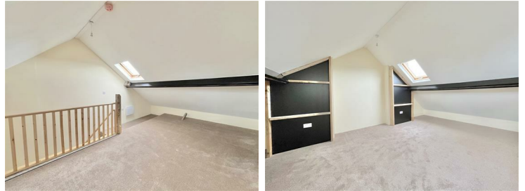
Bedroom One 16'3" x 17'3" (4.96 x 5.28)