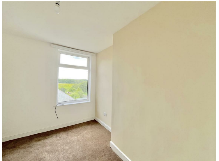
Bedroom Two 12'7" x 8'10" (3.86 x 2.70)