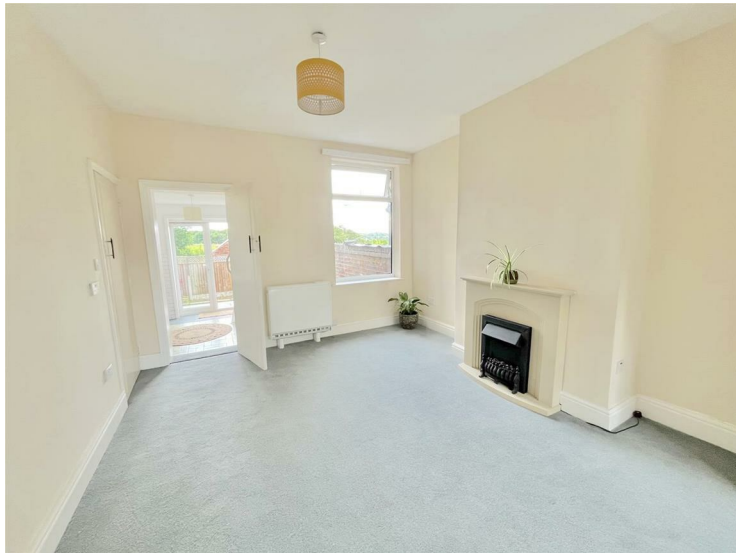
Reception Lounge 12'2" x 13'0" (3.71 x 3.98)