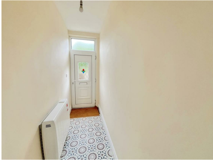
Entrance Hall 14'5" x 3'3" (4.41 x 1.01)