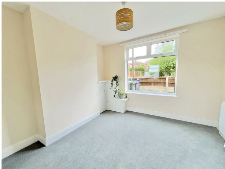
Dining Area 11'2" x 11'7" (3.42 x 3.54)