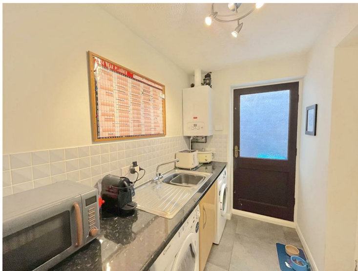
Utility Room 7'11" x 5'2" (2.43 x 1.58)