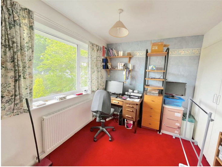
Bedroom Three 11'1" x 8'1" (3.38 x 2.47)