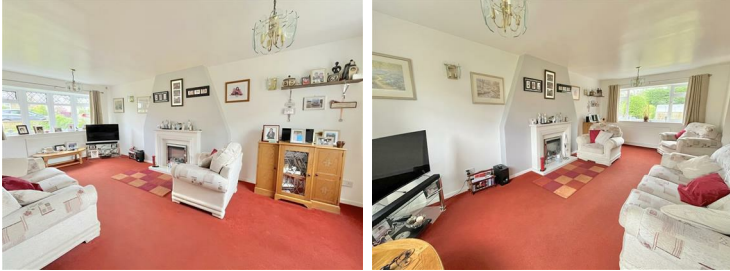
Reception Lounge 21'11" x 11'9" (6.70 x 3.59)