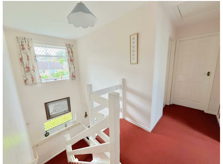
First floor Landing 14'9" x 3'6" (4.52 x 1.07)