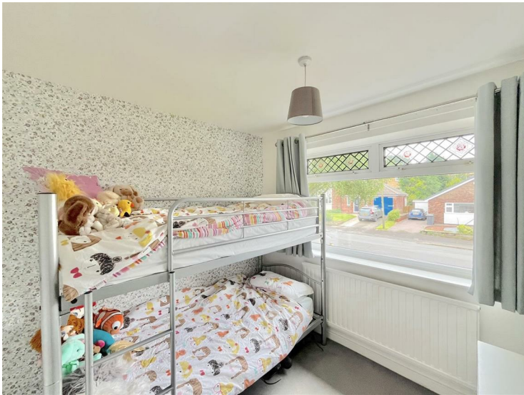
Bedroom Four 8'10" x 9'8" (2.71 x 2.95)

Purchaser information -The Money Laundering, Terrorist Financing and Transfer of Funds(Information on the Payer) Regulations 2017(MLR 2017) came into force on 26 June 2017. Lighthouse Estate Agents & Lettings require any successful purchasers proceeding with a property to provide two forms of identification i.e. passport or photocard driving license and a recent utility bill or bank statement. We are also required to obtain proof of funds and provide evidence of where the funds originated from. This evidence will be required prior to Lighthouse Estate Agents & Lettings removing a property from the market and instructing solicitors for your purchase.