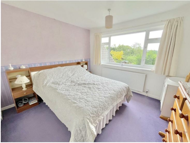
Bedroom Two 11'1" x 11'9" (3.39 x 3.59)