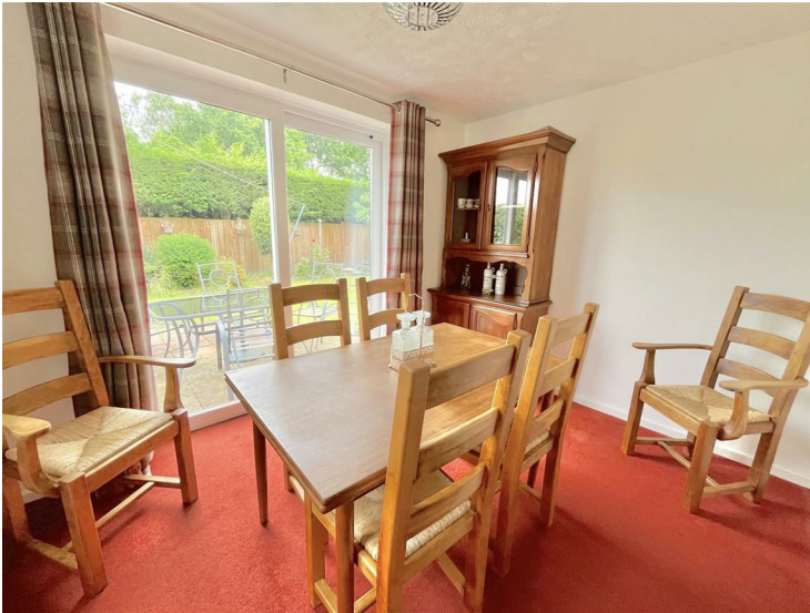
Dining Room 11'3" x 8'8" (3.45 x 2.65)