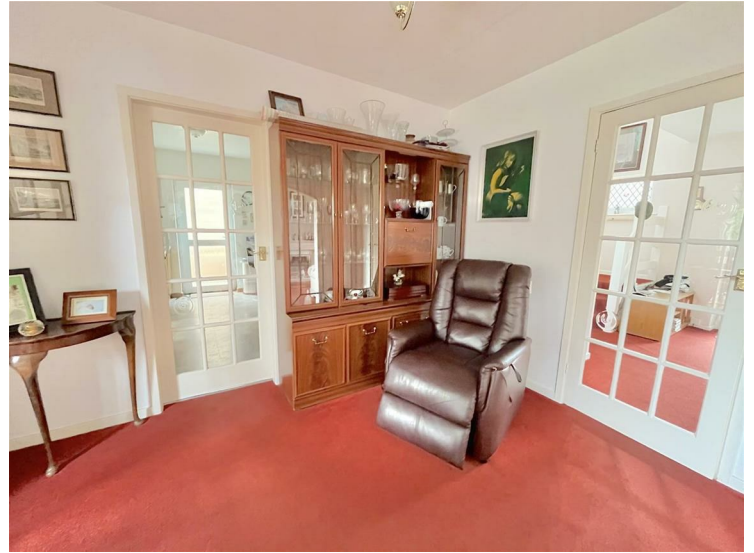
Sitting Room 10'10" x 8'5" (3.32 x 2.58)