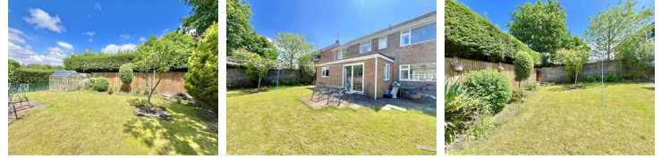
Enclosed Rear Garden