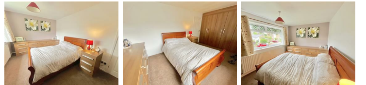
Bedroom One 14'7" x 9'9" (4.45 x 2.99)