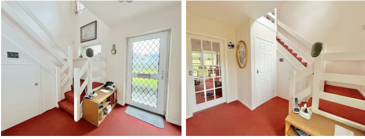
Entrance Hall 10'6" x 8'8" (3.21 x 2.65)