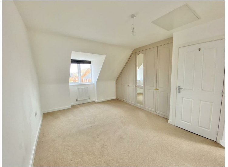
Bedroom One 22'06" x 11'03" (6.86m x 3.43m)