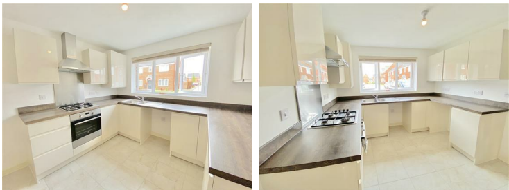
Kitchen Diner 15'02" x 9'05" (4.62m x 2.87m)