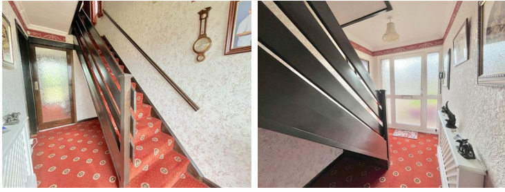
Entrance Hall 11'10" x 5'10" (3.63 x 1.80)