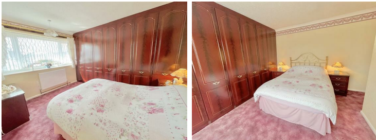
Bedroom One 13'4" x 12'7" (4.07 x 3.85)