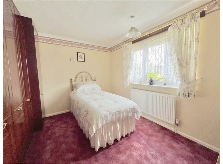
Bedroom Two 13'4" x 9'8" (4.07 x 2.97)