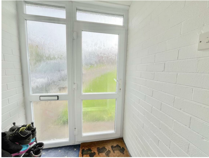
Entrance Hall 5'8" x 8'0" (1.73 x 2.44)