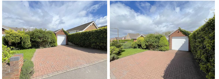
Garage & Driveway