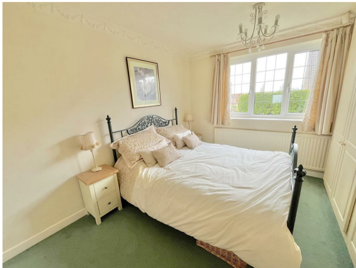
Bedroom Two 12'2" x 10'1" (3.73 x 3.09)