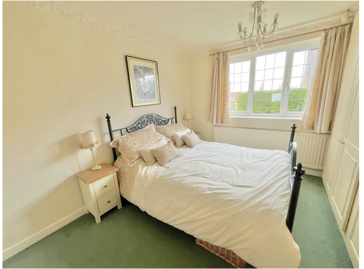
Bedroom Two 12'2" x 10'1" (3.73 x 3.09)