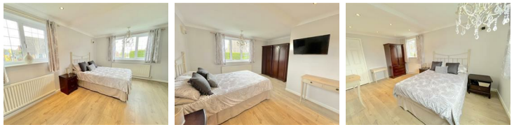
Bedroom One 21'5" x 13'1" (6.54 x 3.99)