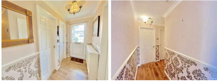
Entrance Hall 11'0" x 3'11" (3.36 x 1.20)