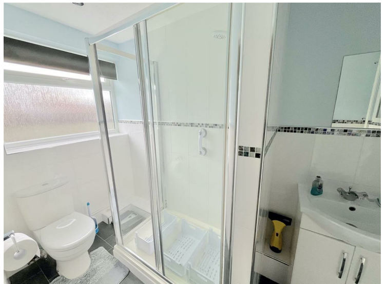
Bathroom 9'6" x 4'9" (2.90 x 1.46)