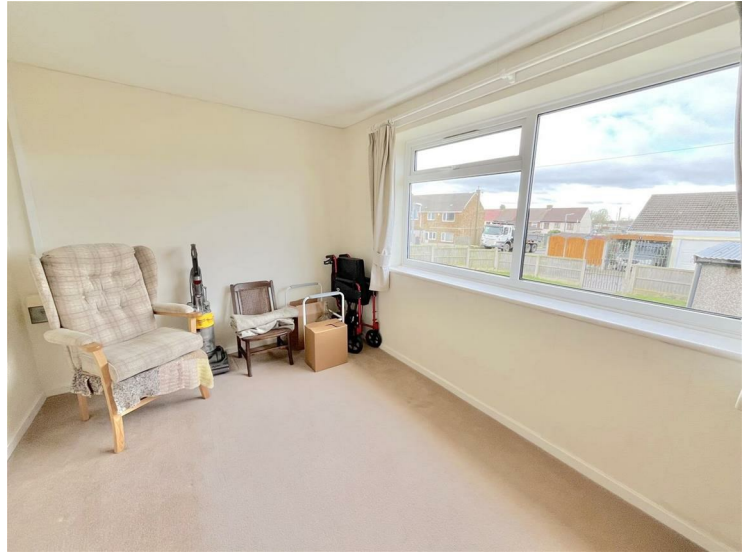
Bedroom Two 13'0" x 8'5" (3.98 x 2.59)