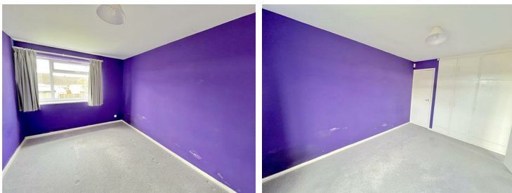
Bedroom One 13'1" x 9'0" (3.99 x 2.75)