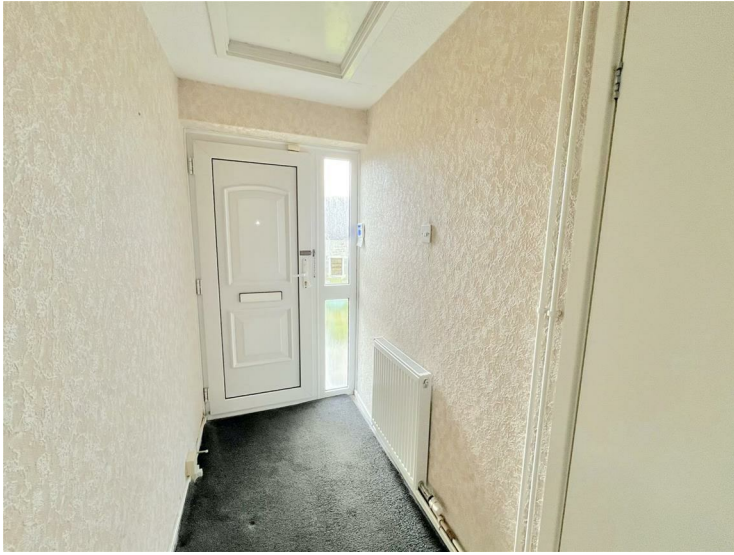
Entrance Hall 10'2" x 3'10" (3.11 x 1.19)