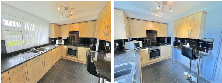
Kitchen 7'10" x 12'8" (2.40 x 3.87)