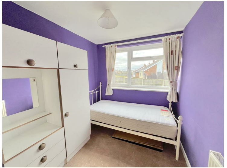
Bedroom Three 9'6" x 7'2" (2.92 x 2.19)