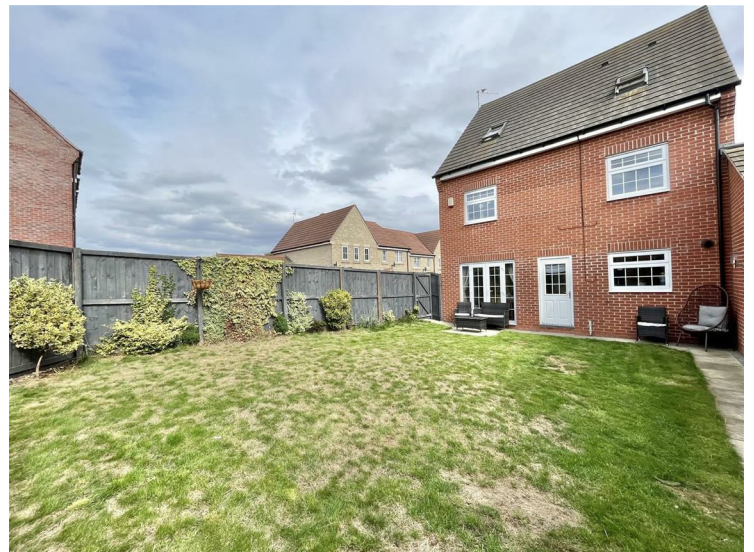
Enclosed Rear Garden