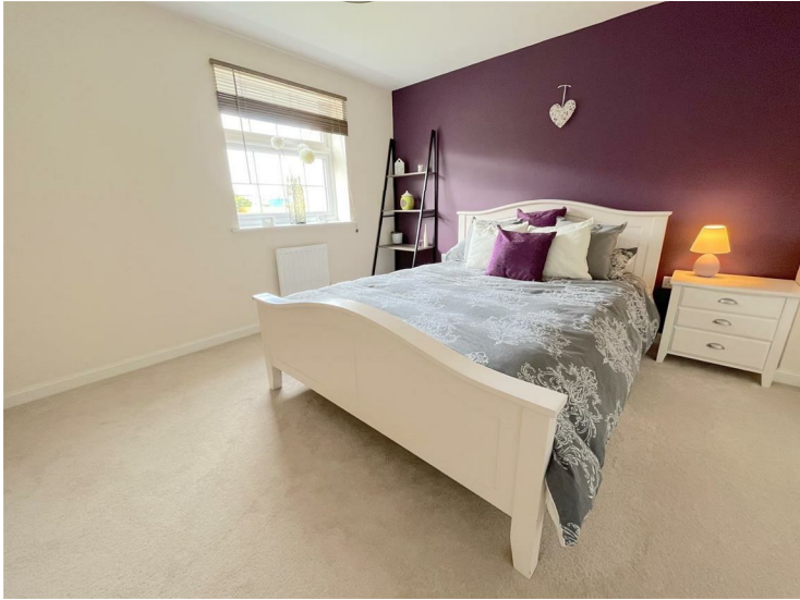
Bedroom Two 12'7" x 11'6" (3.85 x 3.52)