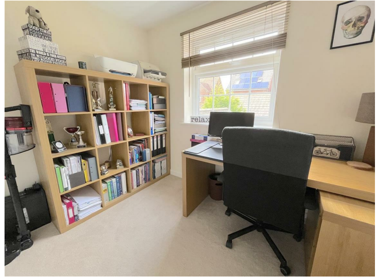
Bedroom Five 9'0" x 6'4" (2.75 x 1.95)