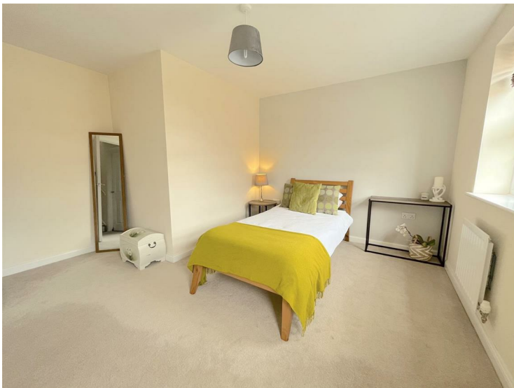
Bedroom Three 12'7" x 8'10" (3.85 x 2.71)