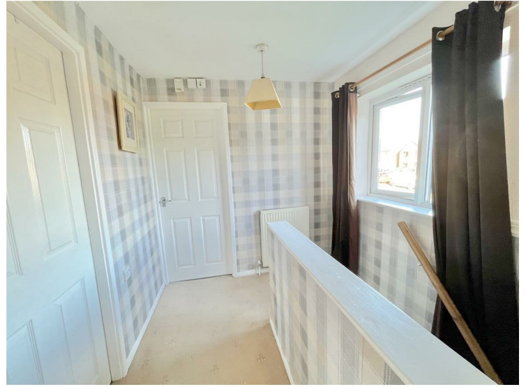
First Floor Landing 9'6" x 7'0" (2.92 x 2.15)