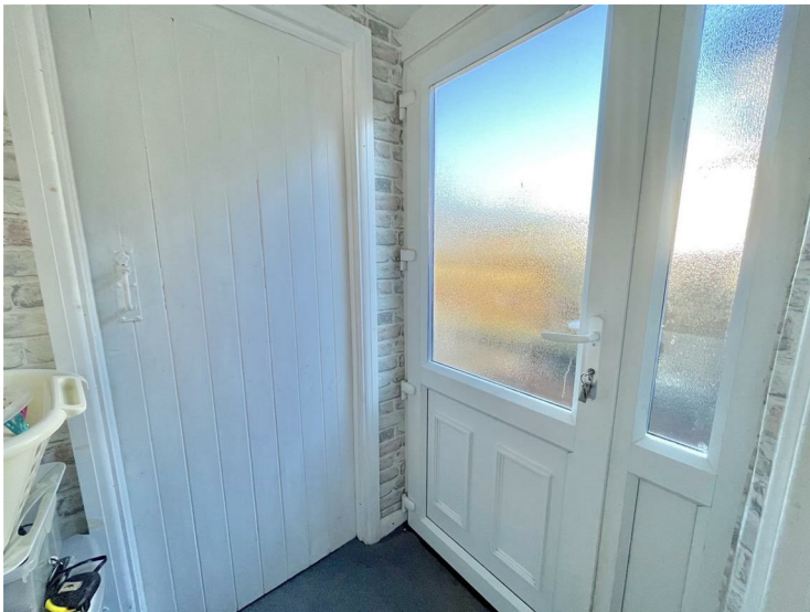
Rear Entrance 6'0" x 3'6" (1.83 x 1.09)