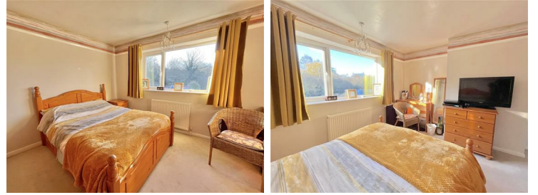
Bedroom One 12'0" x 11'10" (3.67 x 3.62)