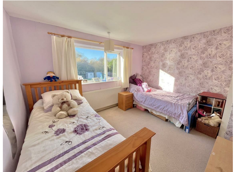
Bedroom Two 12'5" x 11'3" (3.79 x 3.43)