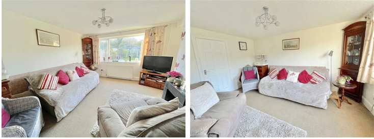
Reception Lounge 15'1" x 18'10" (4.60 x 5.75)