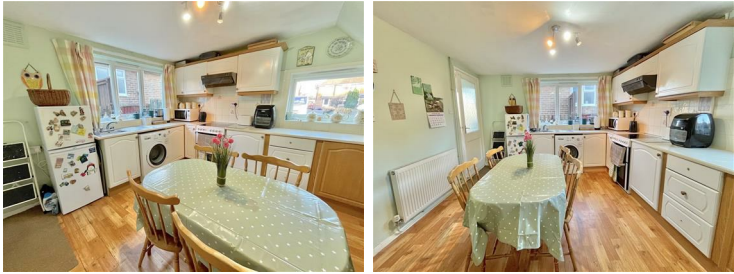
Kitchen Diner 12'2" x 11'6" (3.72 x 3.53)