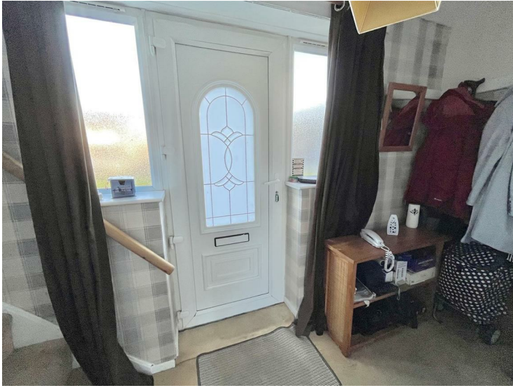
Entrance Hall 7'7" x 3'10" (2.32 x 1.19)