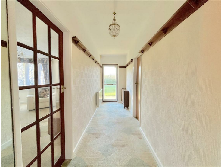
Entrance Hall 21'3" x 4'4" (6.49 x 1.33)