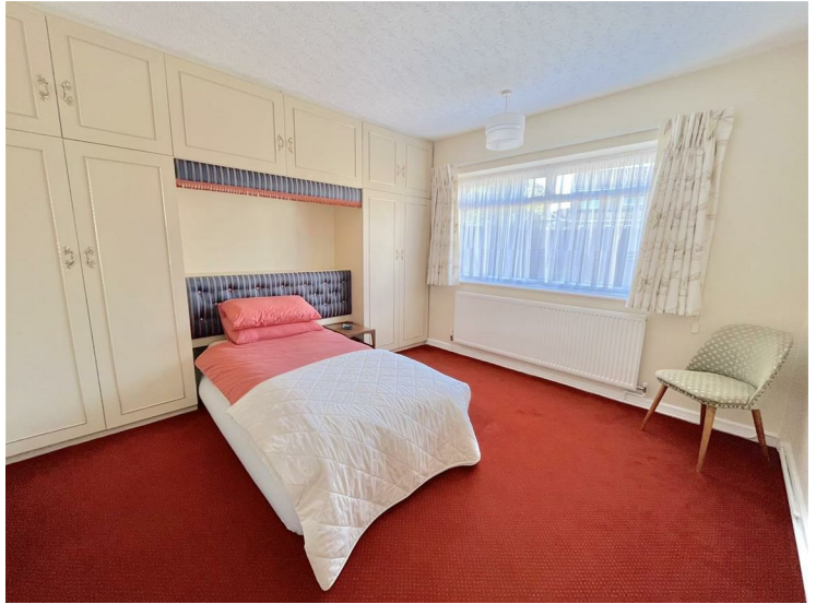
Bedroom Two 11'11" x 12'0" (3.64 x 3.67)