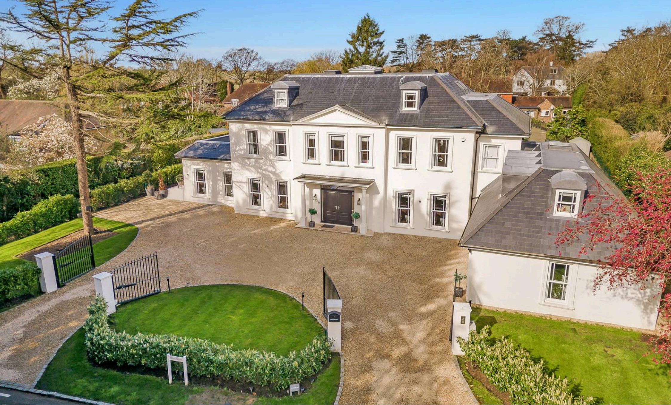
Dendrons The Chase, Oxshott. KT22 0HR £20,000 pcm