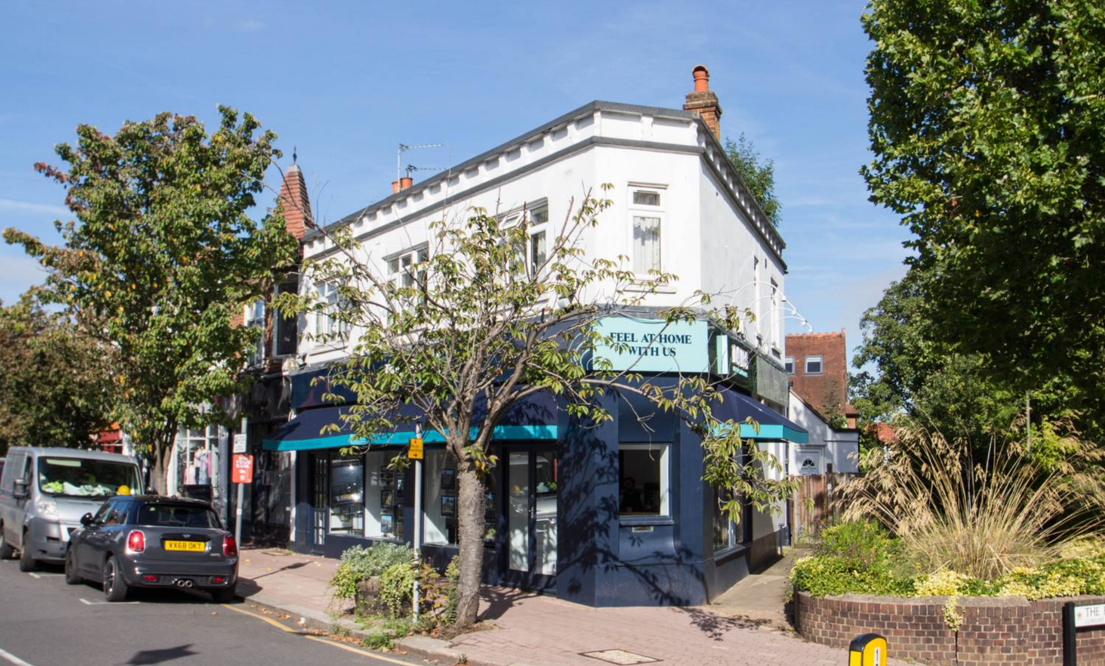
2a The Parade, Claygate £1,595 pcm