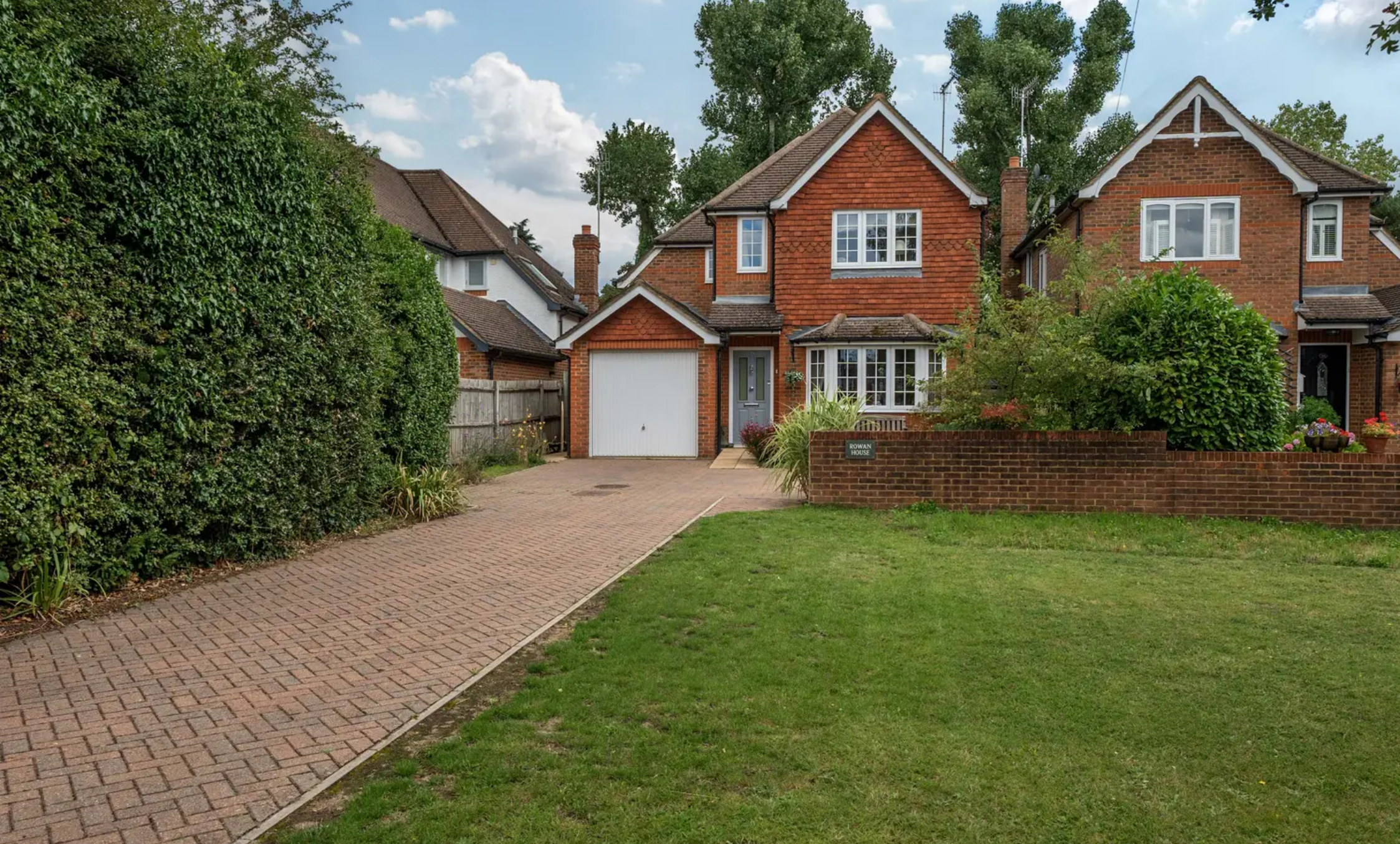
38a Canada Road, Cobham £3,500 PCM