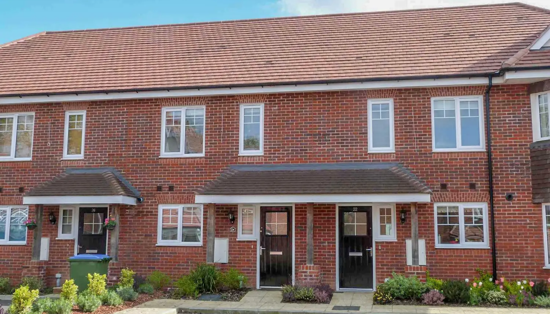
24 Soprano Way, Esher £2,300 pcm