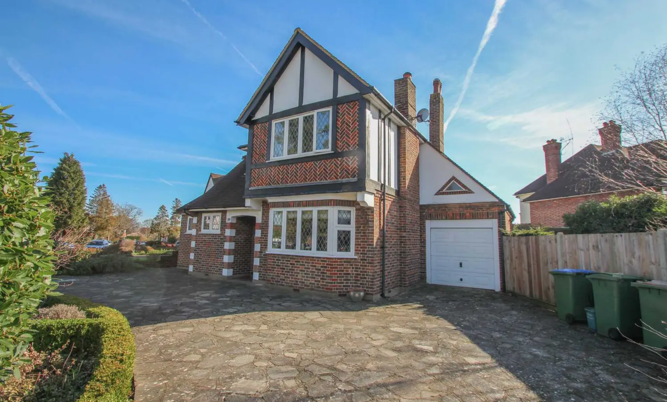
29 Cumberland Drive, Esher £3,100 pcm