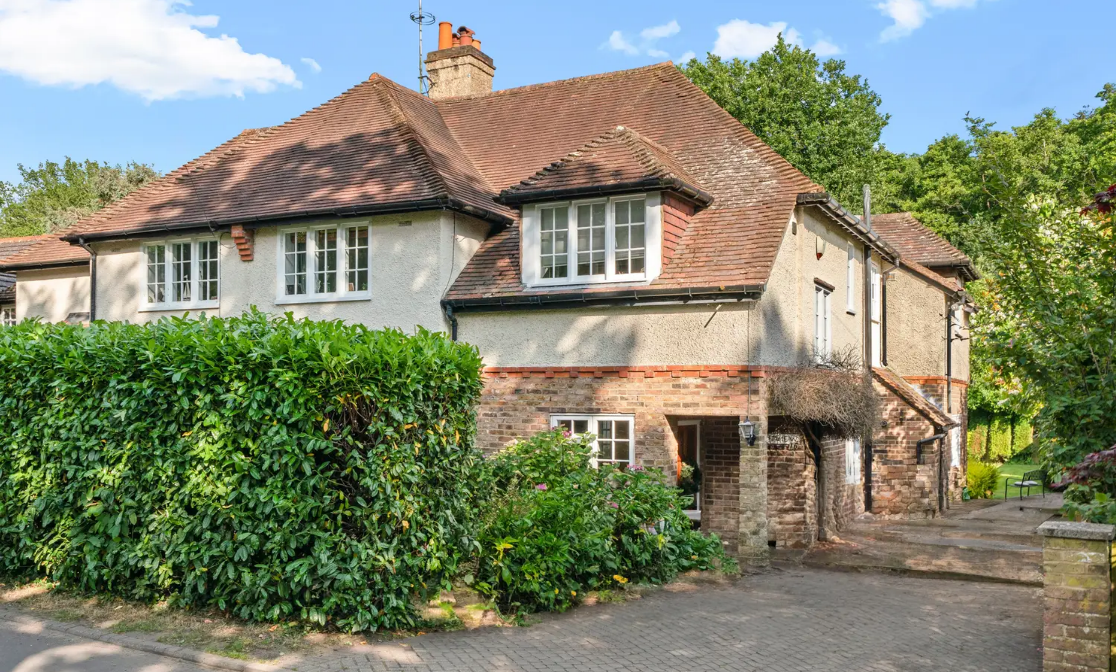
16 Water Lane, Cobham £4,300 pcm