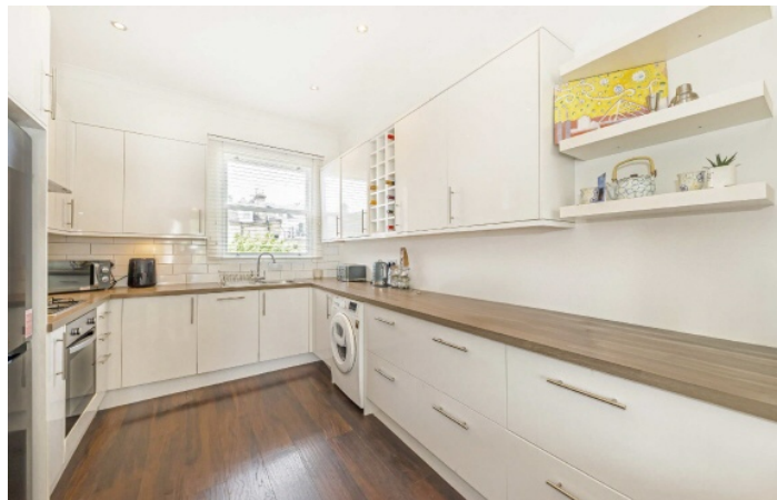
Sumatra Road, NW6