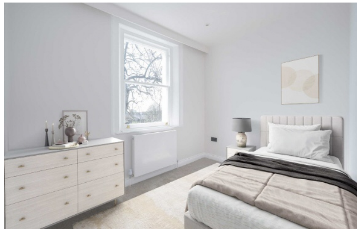
Abbey Road, NW6