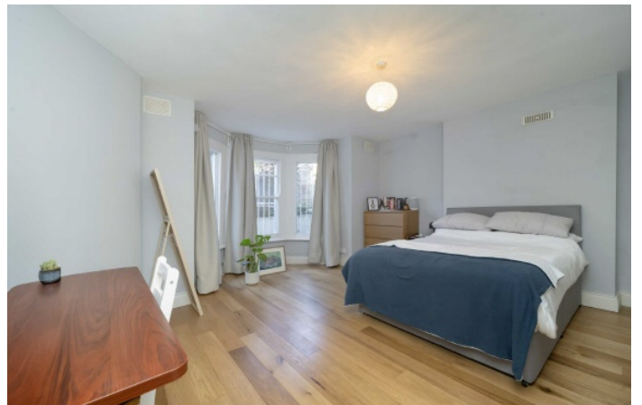
Sumatra Road, NW6