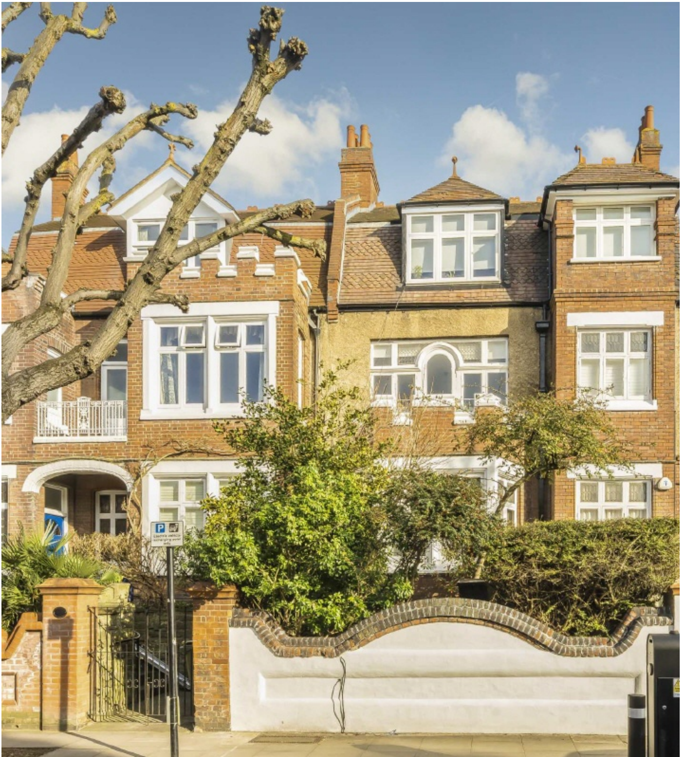
Fawley Road, NW6 £1,100,000