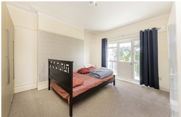
Kings Gardens, NW6