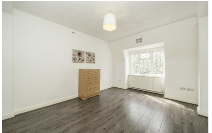
Finchley Road, NW2