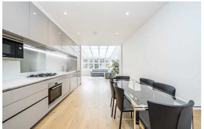
Ardwick Road, NW2