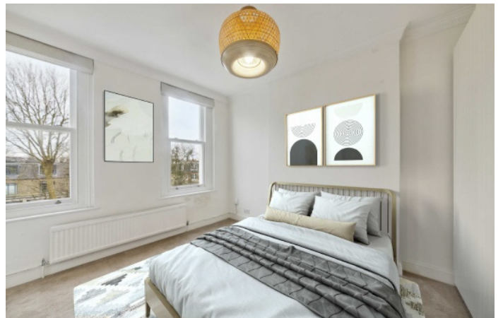
Greencroft Gardens, NW6