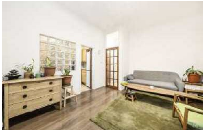
Goldhurst Terrace, NW6