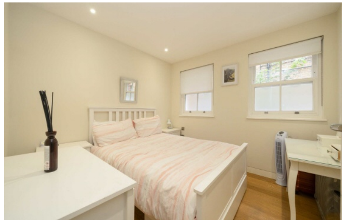
West End Lane, NW6