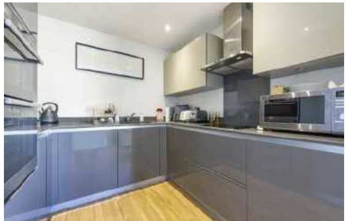
Finchley Road, NW11