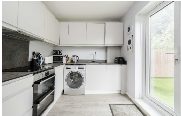
Cricklewood Lane, NW2