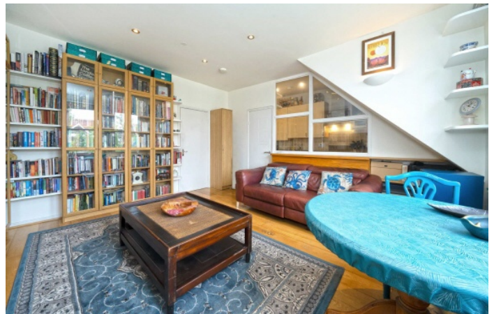
Buckley Road, NW6