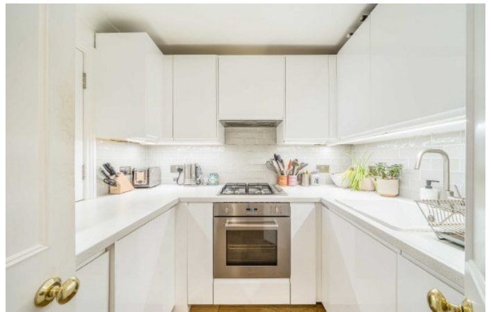
Lowfield Road, NW6