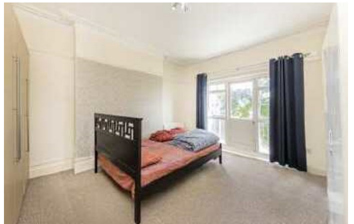
Kings Gardens, NW6