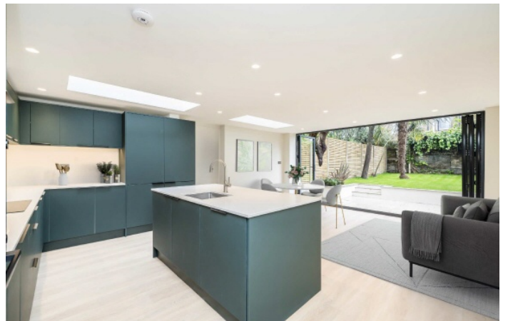
Sumatra Road, NW6