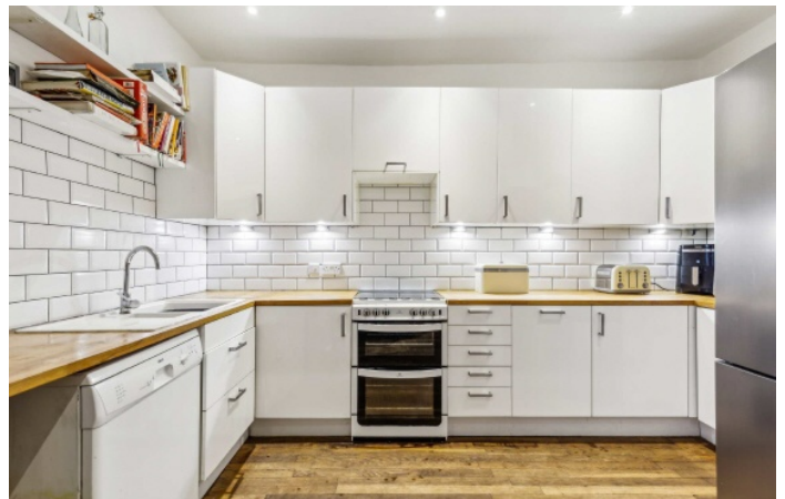
Birchington Road, NW6