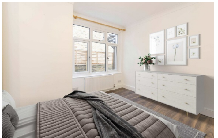
Burton Road, NW6