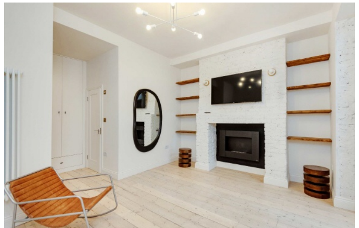
Gascony Avenue, NW6