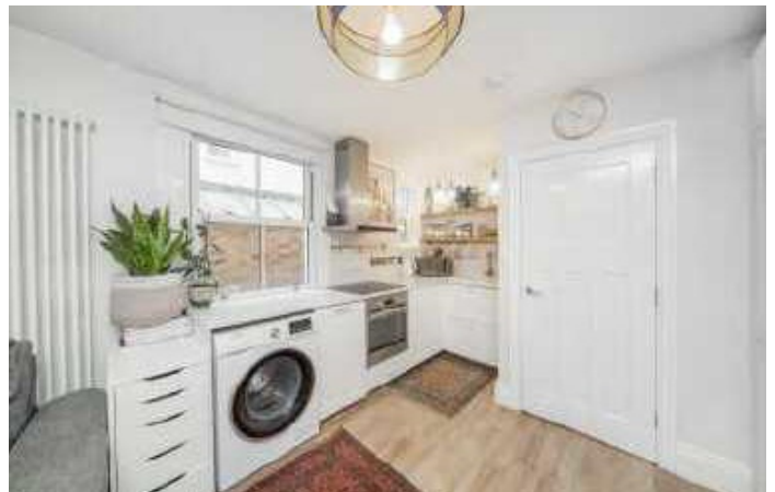
Sumatra Road, NW6