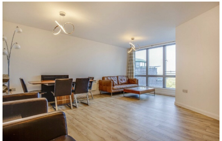
Fortune Green Road, NW6