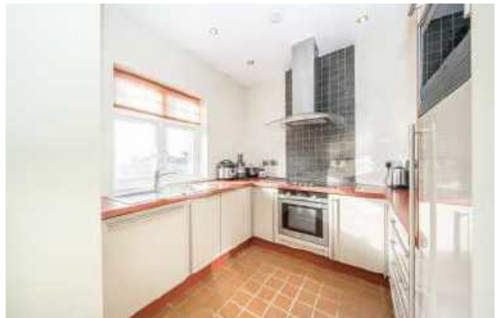
Llanvanor Road, NW2