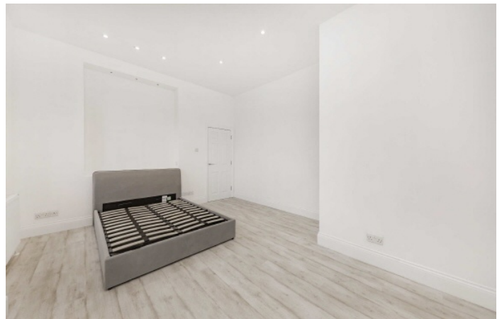
Gondar Gardens, NW6