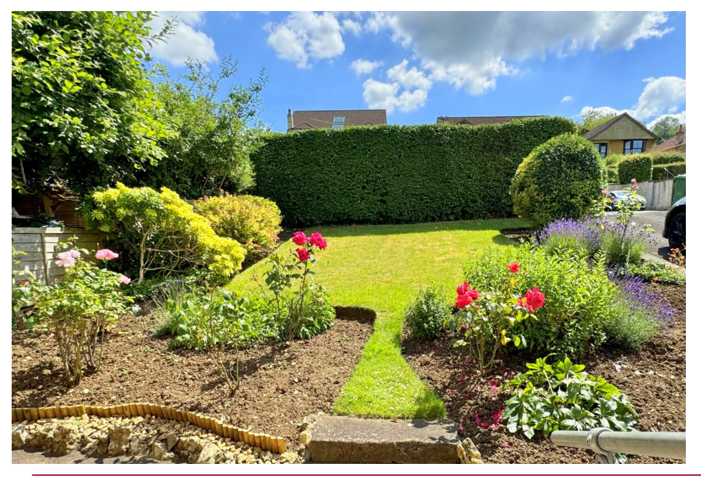
6 Princes Buildings, Bath, BA1 2ED

The village of Bathampton is, quite rightly, highly sought after. The doctors surgery, café, Post Office, Spar, 'outstanding' primary school, children's playground, church, regular bus services and the famous 'George' and Bathampton Mill public houses are all within a short stroll, yet delightful walks in the surrounding countryside - through open fields, up towards Hampton Down or along the side of the Kennet and Avon canal (either towards Bradford-on -Avon or into the city) are close to hand. The centre of Bath is about 1½ miles away, easily accessible by car, bus or even along the towpath.